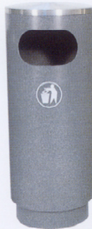
MP-69 400 Dia x 965 Ht mm