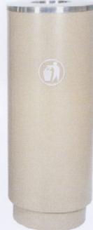
MP-86 400 Dia x 965 Ht mm