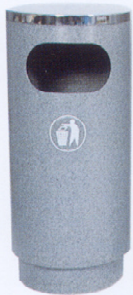
MP-56 400 Dia x 850 Ht mm