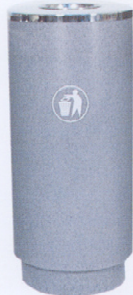
MP-68 400 Dia x 850 Ht mm